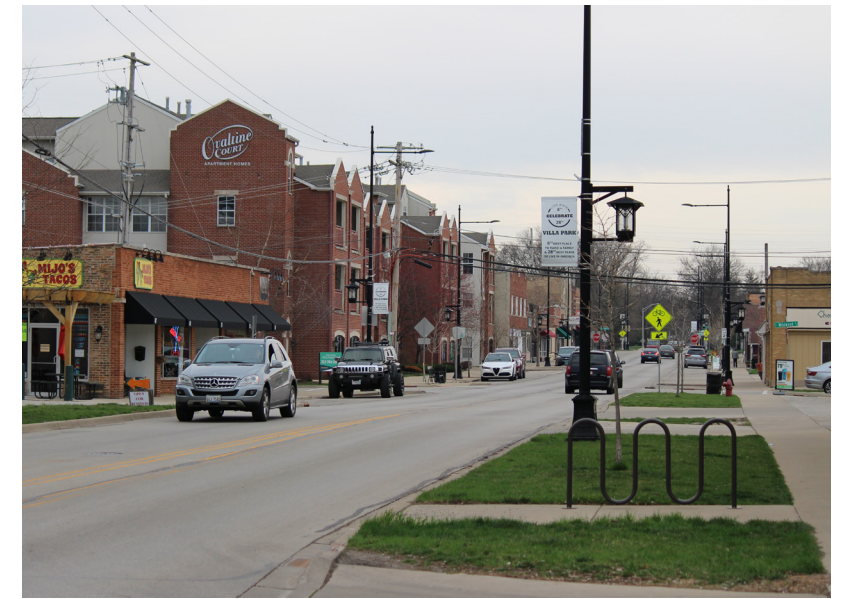
Villa Avenue Looking South