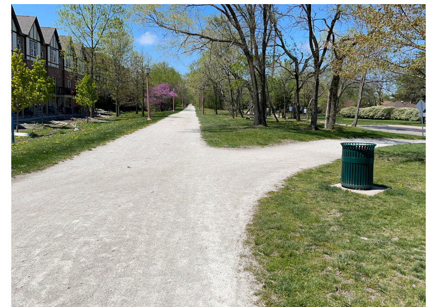
Great Western Trail Path Connection